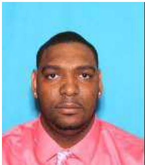
DWIGHT A. DAVIS